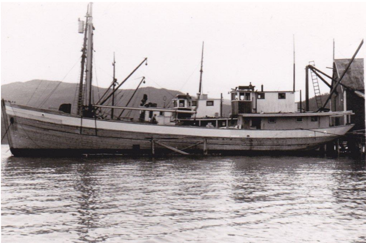
"Kjøpsvik" after reconstruction.