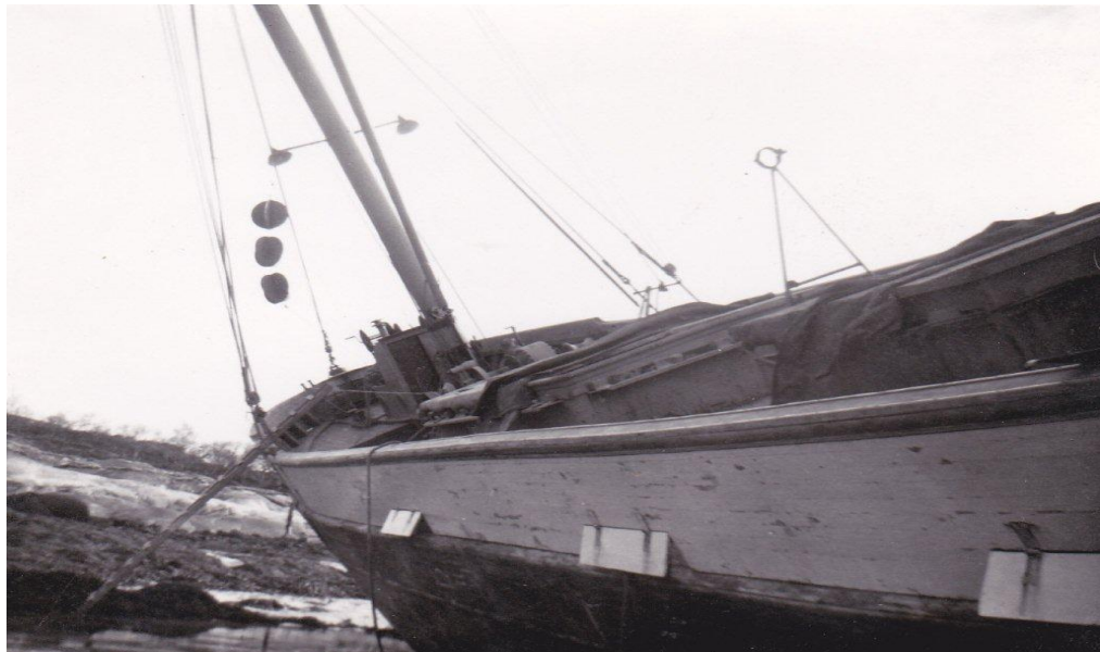
Went ashore in Tjeldsundet.