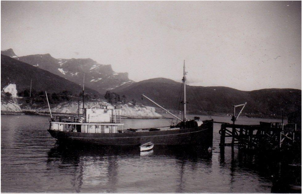
"Kjøpsvik" quayside to J.Lind Kjøpsvik