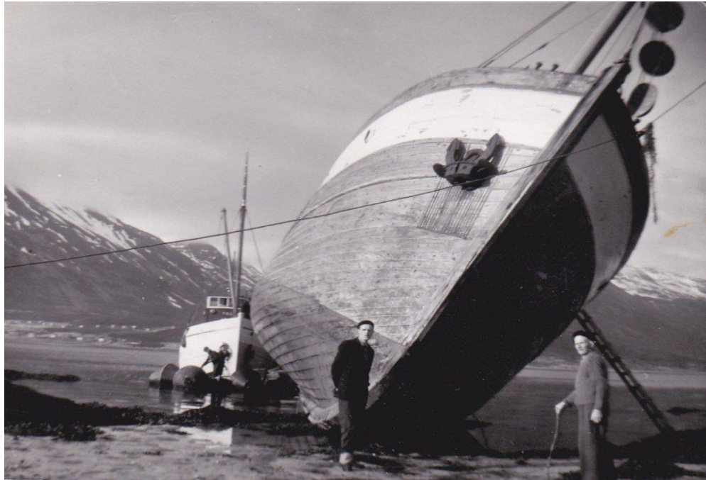
Withdrawn because of "Torak" from Sørkil in Hamarøy.