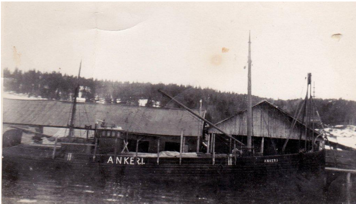
As "Anker 1" loading lumber in Fredrikstad in October 1940.