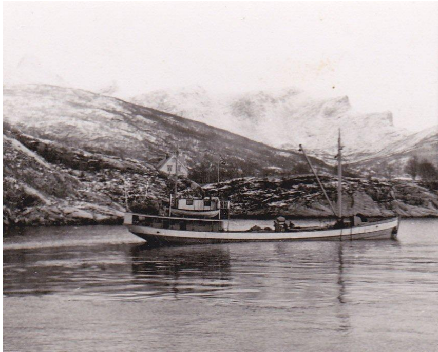
"Kjøpsvik" loaded with 189 tons of cement in Kjøpsvik.